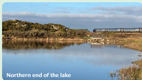
Northern end of the lake

with a kissing-gate and red brick boundary walls on your left. Climb up the few steps to the next field and rocky outcrops. The path now follows the line of the bracken through the field in the direction of Tŷ Hen Holiday Park and through a kissing-gate. Follow the waymarker at the gate and bear right along the lakeside ( not over the stile towards the static caravans ). Walk between the rocky outcrops and gorse, and follow the yellow marker posts through vegetation to the field. Go through another kissing-gate to the next yellow marker post, and walk down to the lakeside, passing the rocks on your right to the gated footbridge over the stream at the farthest point of the lake.